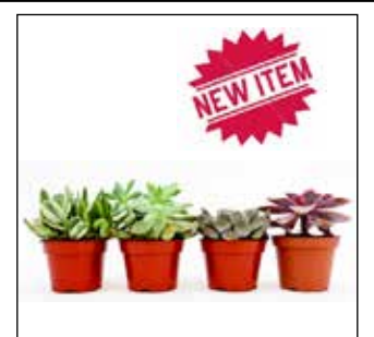
10-pack 4" Succulents Fast-growing in popularity, succulents are versatile & low maintenance. Ideal as house decor and gifts! This 10-pack offers excellent variety and textures from the echeveria, sedum, sedeveria and senecio families. Duplicates & substitutes may occur.