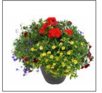
12" Premium Patio Planters All planters include an assortment of our top performing plant collections. Planters can be exposed to full sun areas. Perfect for creating a spring patio or backyard paradise.