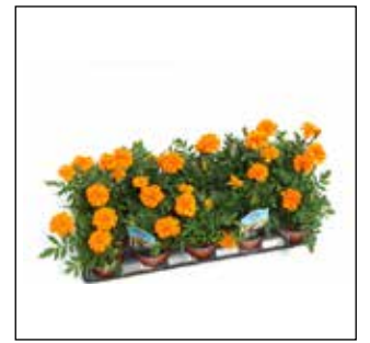
10-pack 4" Marigolds

Colours: Purple, White Cannot mix & match colours in a flat