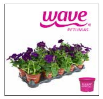
10-pack 4" Wave Petunias

Colours: Red, White, Pink Cannot mix & match colours in a flat