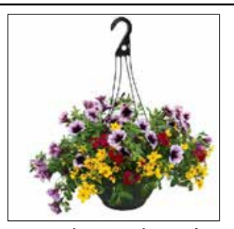
12" Premium Hanging Baskets Our improved flower mixes are sure to be a big hit! These hanging baskets can be exposed to full sun with the best flowering and trailing plants. There are a variety of mixes/colours.