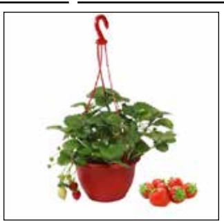
12" Strawberry Basket A kid favourite! Enjoy fresh strawberries all summer long. Ever bearing strawberries with different coloured blossoms in white or pink. Beautiful and delicious!