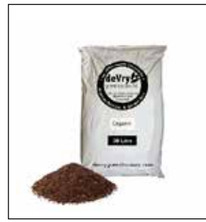
Premium Soil 30 L

A bag of organic potting soil, perfect for filling containers. This hearty mix helps plants grow to their full potential. Enriched with: compost, kelp, fish meal, peat moss, glacial rock dust, & rice hulls.