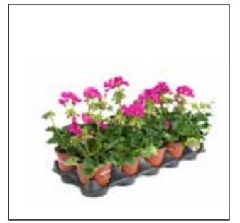
10-pack 4" Zonal Geraniums

These easy to grow bedding plants add vibrant colour to your garden. Resistant to pests such as deer/rabbits.