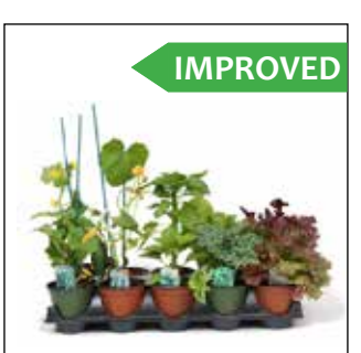
10-pack 4" Veggies Grow your own food this year in a garden or planter box! Varieties include: