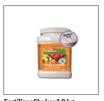
Fertilizer Shaker 1.8 kg

A bag of organic potting soil, perfect for filling containers. This hearty mix helps plants grow to their full potential. Enriched with: compost, kelp, fish meal, peat moss, glacial rock dust, & rice hulls.